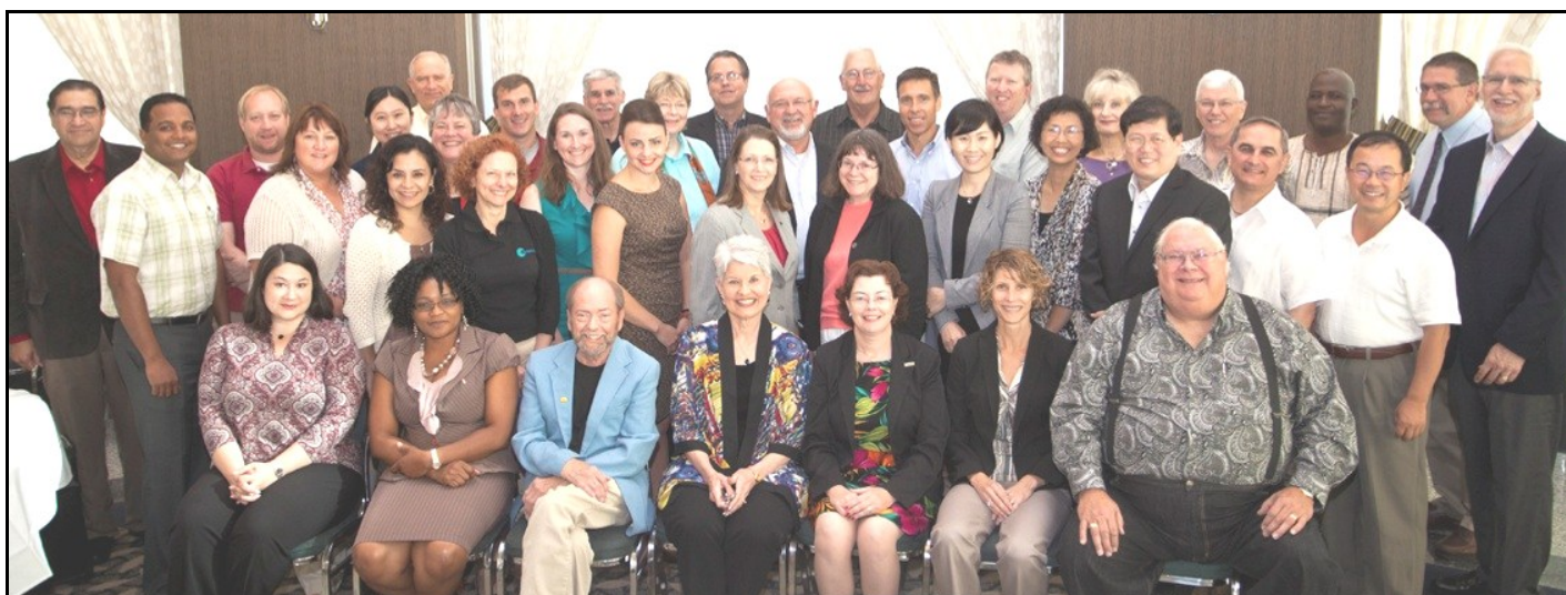
IAFP Affiliate Council Meeting, July 22, 2012.